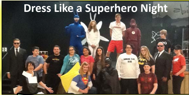
Dress Like a Superhero Night

In our life, God desires to provide us a sure and safe place to stand that is rooted in his love and the promises of His Word. Solid Ground is our youth group of young people Mid-High through Senior High. We gather Sunday nights for worship, games, testimonies, fun, fellowship, and a short challenge from the Word of God. We hope you will choose to come stand tall and firm among us on Sunday nights.